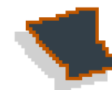
Anderson County 70 Surveys