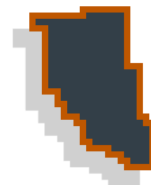
Cherokee County 48 Surveys