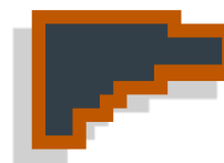
Delta County 24 Surveys