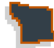
Henderson County 55 Surveys