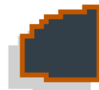
Hopkins County 38 Surveys