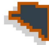
Rains County 38 Surveys