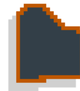
Red River County 37 Surveys